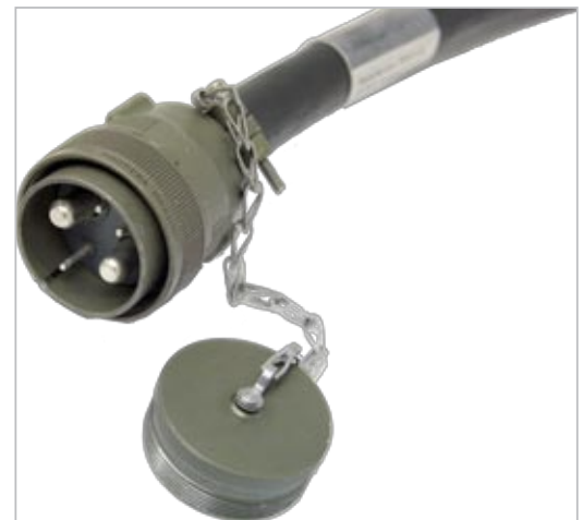
TI16000-476 : MS3106F32-1P Straight Plug