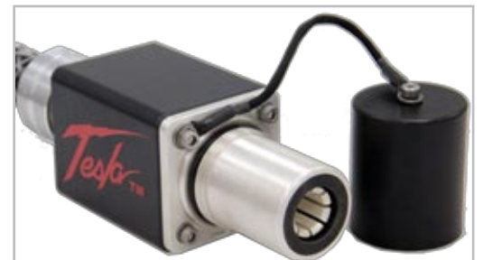
TI2000-376 : Inline NATO DC Receptacle