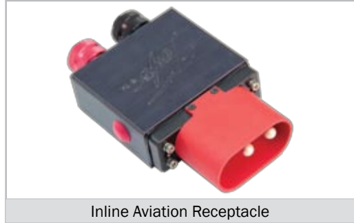
Inline Aviation Receptacle